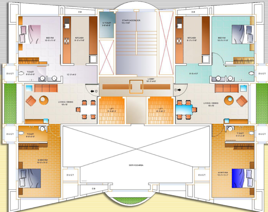
PLAN AT 8TH & 15TH FLOOR